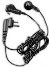
Earbud with PTT Microphone HMN8435A