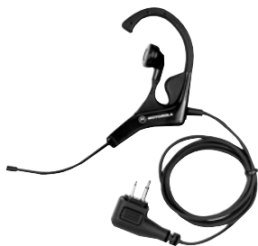
Earpiece with Microphone BDN6774A