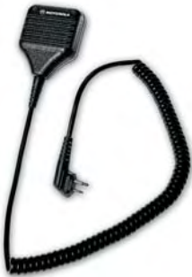
Remote Speaker Microphone HMN9051A