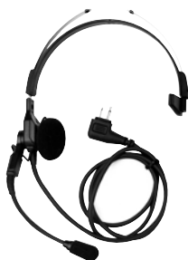
Headset with Swivel Boom Microphone BDN6773A