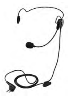
Lightweight Headset with Boom Microphone 53815