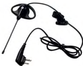
Earpiece with Boom Microphone 56518