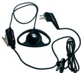
Earpiece with inline PTT & Microphone 56517