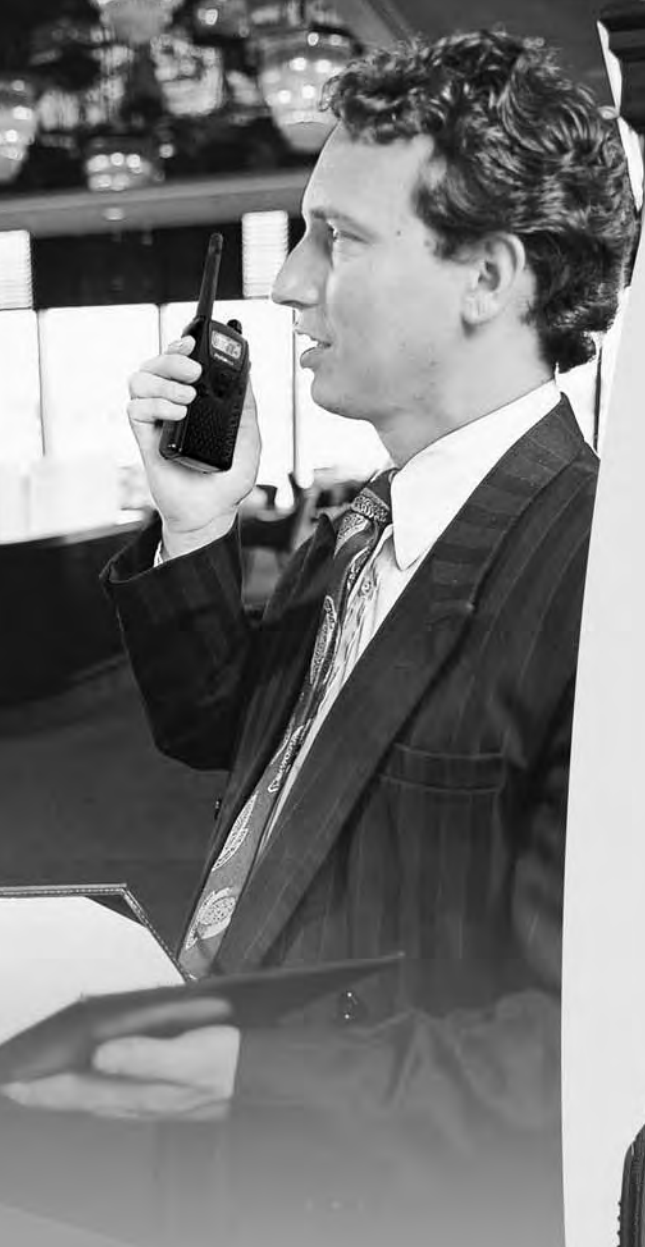
ProTalk ® XLS TK-3230K XLS